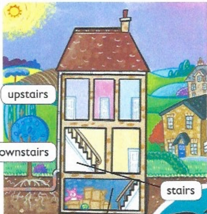
A house in the village